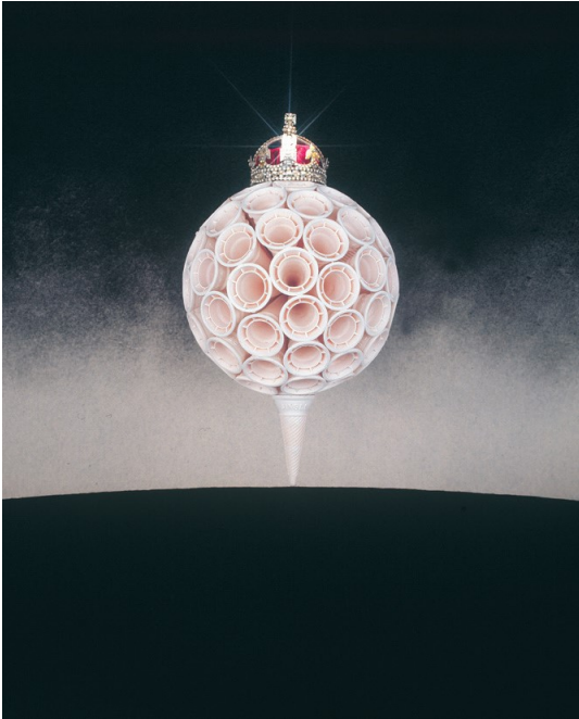
Jacky Redgate Work-to-Rule IV 1986–7, Cibachrome photograph, 102 x 80cm.

What is your first impression? What do you see? What do you experience or feel? What are you reminded of?